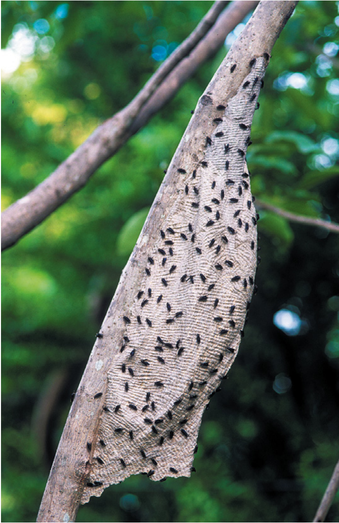
1. A nest of the wasp Parachartergus fraternus in Costa Rica.

1. Een nest van de wespe Parachartergus fraternus in Costa Rica.