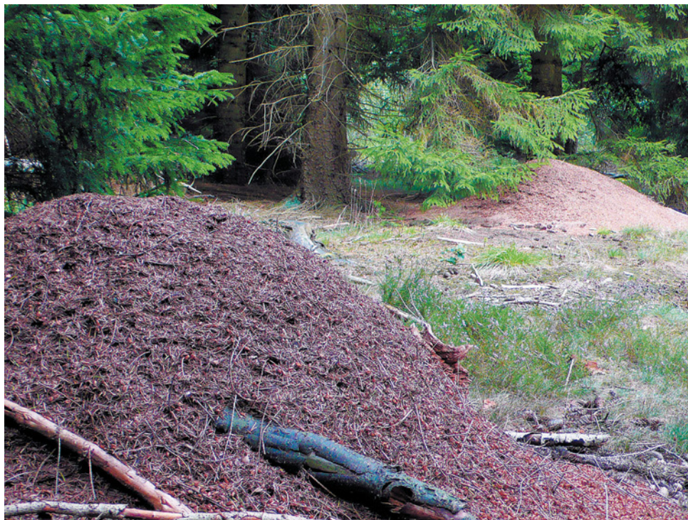
2. Nest mounds of Formica polyctena are often the result of budding and may therefore be situated in close proximity of each other.

2. Koepelnesten van Formica polyctena komen vaak door 'budding' tot stand en liggen vervolgens vaak vlak naast elkaar.